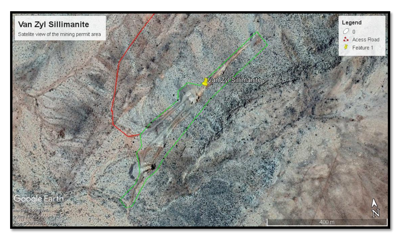
Figure 2: Satellite view of the Van Zyl Sillimanite mining area, where the green polygon indicates the mining boundary.

Problem plants mainly germinate in the disturbed areas such as the quarry pit, stockpiled berms and stockpile areas. A list of the alien invasive species identified during the site visits is provided below inclusive of the mechanical and herbicide control measures for eradication of the identified plant. If no mechanical methods can be used herbicides will be used (refer to Table 1).